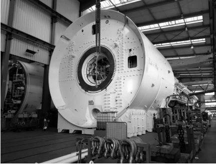
Coming to the Chilterns soon!

Finally, I read the detail and found that schools had supposedly come up with just three names from which the choice is to be made – each of which happens to be a famous female scientist (Marie Curie; Florence Nightingale and Cecilia Payne-Gaposchkin) – and, for each of whom, HS2 Ltd had found some spurious link with Buckinghamshire. The public was in fact not being asked to “choose a name”, but rather simply being asked to reject one of the children’s choices. Now, I’m just plain angry!