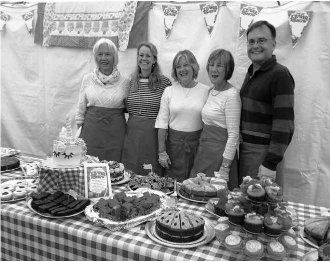
You are all invited to tea... on 17 th July 2021