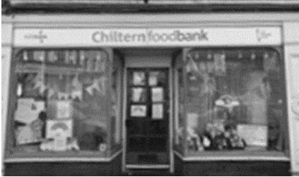
Chiltern foodbank in Chesham

at The Lee Committee has agreed to set up a permanent food collection point within the shop. With such challenging times and increasing numbers of people struggling to make ends meet, the Committee felt they would like to offer the opportunity for members of our community to support and regularly donate to the foodbank.