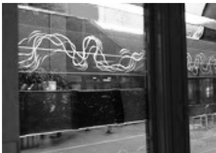
'Day by day' at Stoke Mandeville Hospital

work and the collaborative processes that are essential for creating good art for public spaces.