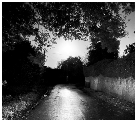
This picture taken outside Home Farm, close to Remembrance Sunday, brought to mind the song by Mike Harding 'Bomber's Moon'